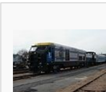
The remnants of engine #503 (March 2009)