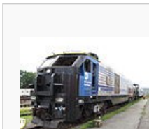
The remnants of engine #503 (August 2011)